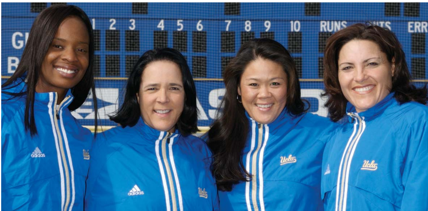
UCLA COACHING STAFF (L TO R): NATASHA WATLEY, GINA VECCHIONE, KELLY INOUE-PEREZ, LISA FERNANDEZ

Inouye-Perez earned her B.A. in psychology from UCLA in 1993 and her master's degree in physical education from Azusa Pacific in 2004.